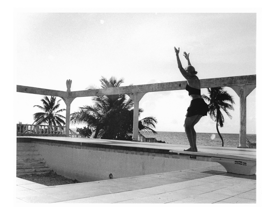
"Shallow Diving" by Barbara Rose

We really wished we had gone through a more reliable booking agency while vacationing in Belize with the pools conditions...kidding. Down the beach from our lovely hotel we happened upon a deserted resort just brimming with photography possibilities. I loved trying to create live scenes in a ghost town beach resort. Black and white seemed suited for this type of scene. This was shot with a Nikon FE film camera with a 50mm lens. It was also helpful to have a travel companion who is always ready to be a model and helped me create this scene of life amongst an abandoned backdrop. I felt having a person not only added life but connection for the viewer. I developed the film and the print myself using the darkroom at Bemis Art School. I love the entire process that is required for film. These days it is rare to have an activity that doesn't have immediate results.